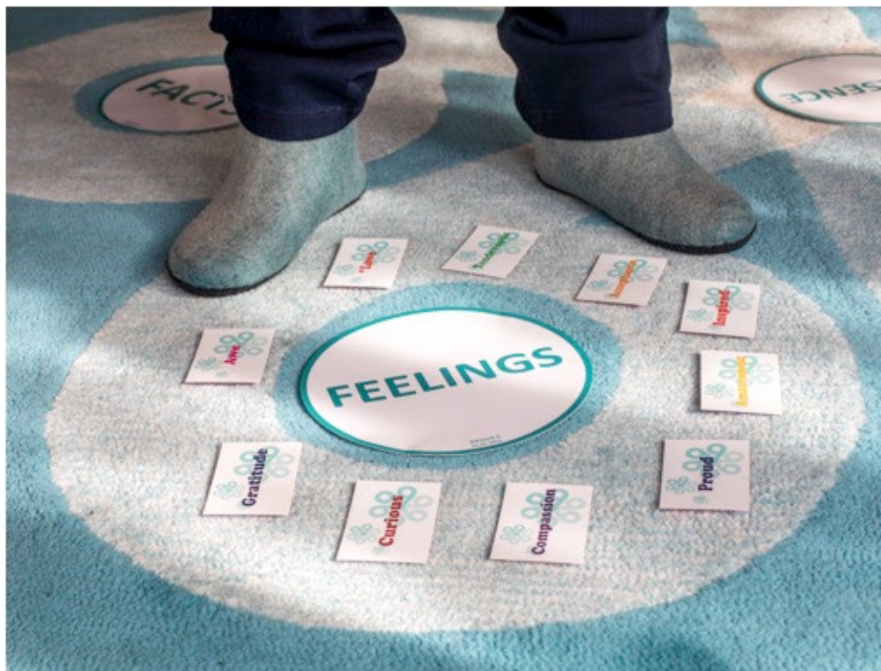
Figure 1: Louie walking the mat

► ♦ In my poem ‘ Re-mem-bering me ’ I refer to a framework called the P6 Constellation, the representation which found its first instantiation in the form of a bespoke circular rug, upon which I invited people to walk as they talked.