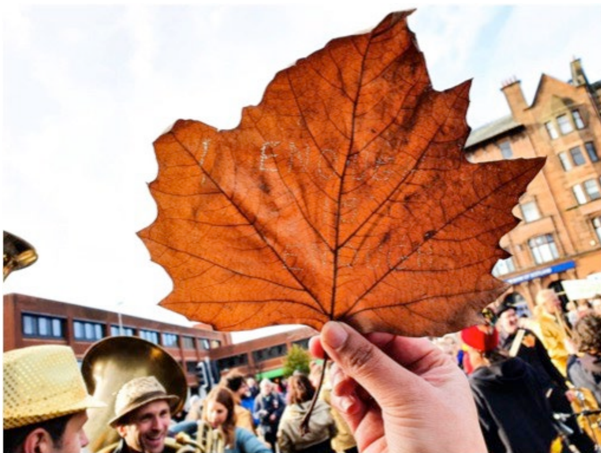
Figure 2: Enough is Enough, performed at COP26, Glasgow, (Photo Dave Hammond, 10 November 2021)

► Nowadays, I am but one of a growing number of PIA Practitioners. We engage regularly in our community-in-practice, deepening and extending our acuity, agility, fluency and artistry in our daily lives. We do our personal processing; support each other 1-1, informally and in praxis-development triads; we engage in supervision and support new people to experience this work as practice partners in formal training sessions; and we participate in up to four community-in-practice gatherings each year. These take place in person and online depending on what is possible. This extending learning ecosystem co-evolves as our learning needs shift with the wider contexts in which we find ourselves. We constantly experiment with new ways to organise and take action, alone and together, in ever-shifting configurations. In January 2019 we established ourselves as a Community Interest Company – PIA Collective – to bring PIA to people everywhere we are. Our economic exchange model is based on what we call a ‘Sufficiency Principle’ in which we, along with many others, recognise that enough is enough xii .